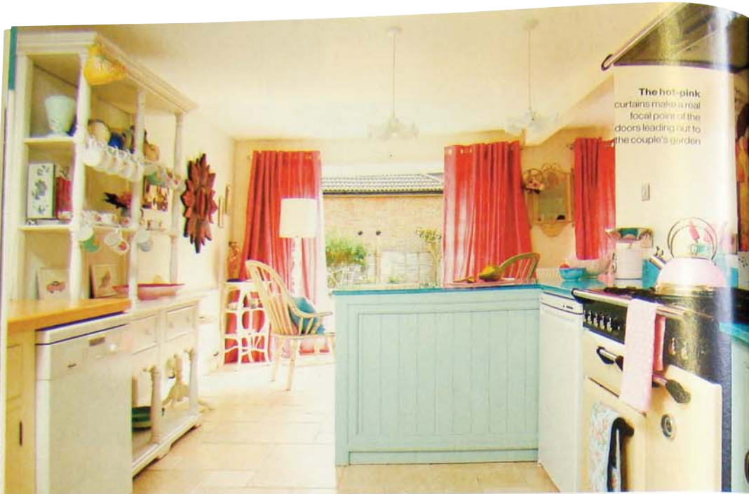
The hot-pink curtains make a real focal point of the doors leading out to the couple's garden

It was quite a daunting task taking the measurements ourselves, but we found it really helpful to draw it out on the floor first to see how the space would work.