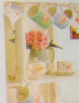
Above and below Suzi strapped up the dresser from a local shop to display her china collection. The colours work well with her painted blue worktop.